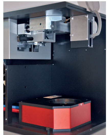
Interior view of the BeamControlSystem: Top, FocusMonitor; bottom, CompactPowerMonitor